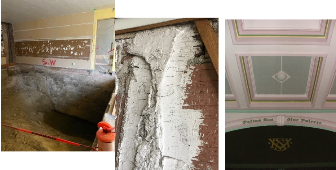
Middle photo: Found behind a blackboard: "Freddie Smertz was here 1914"

200. The Fernwood Street-facing Main Student Entrance will be expanded, while the grand front entry remains to complement the largely unchanged exterior.