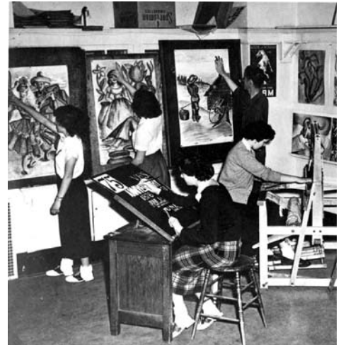
VHS Art Class 1951