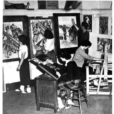
VHS Art Class 1951