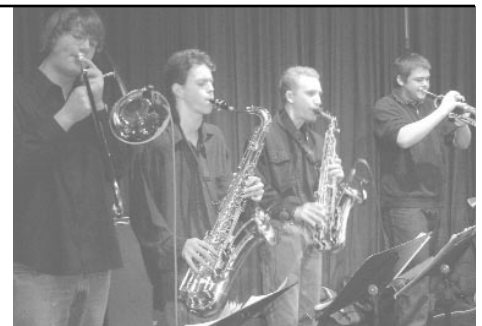
The R&B Band at work

Vic High’s R & B program has been such a success that some of the members of the current and past R & B bands have formed their own extracurricular groups in the city, enriching the musical culture of Victoria.