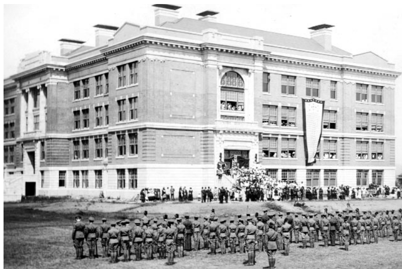
Ceremony in 1919-20 honouring Vic High alumni who served in WWI